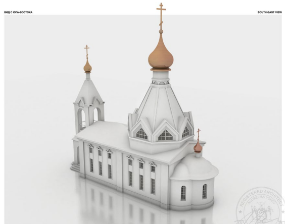
View from South East.