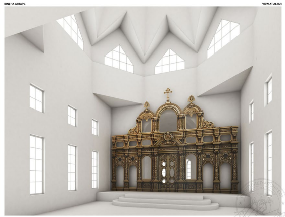
View at the Altar and Iconostasis.